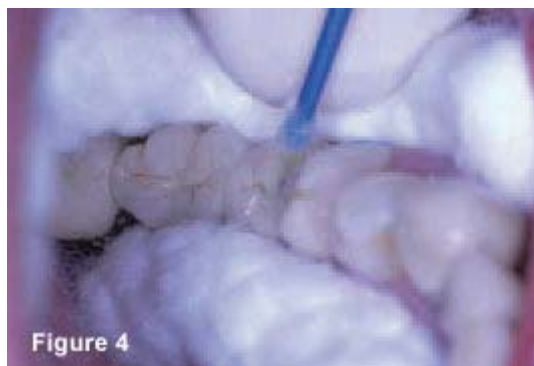
Figure 4 — After etching, rinsing, and drying, Embrace First-Coat was applied to the etched and abraded surfaces with a brush applicator, thinned with a gentle stream of air, and light cured for 20 seconds.

After applying First-Coat (Figure 4), Embrace Opaquer, which cures in just 20 seconds, can be used to mask metal or discolored surfaces (Figure 5). Heraeus Kulzer's Venus composite resin was placed over the opaque layer and light-cured for 20 seconds (Figure 6). The restoration was then contoured and finished using SS White finishing burs and polished with Clinician's Choice Groovy Diamond Polishing Brushes .