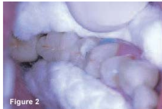
Figure 2 — Kool-Dam was used to protect the gingiva and isolate the area to be repaired, ensuring a dry field and masking areas not to be etched.