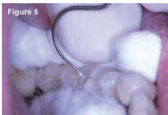
Figure 5 — Embrace Opaquer was placed in the center of the exposed metal and carefully spread with an explorer so that it was not on the beveled porcelain margin. The opaquer was light-cured for 20 seconds.

After applying First-Coat (Figure 4), Embrace Opaquer, which cures in just 20 seconds, can be used to mask metal or discolored surfaces (Figure 5). Heraeus Kulzer's Venus composite resin was placed over the opaque layer and light-cured for 20 seconds (Figure 6). The restoration was then contoured and finished using SS White finishing burs and polished with Clinician's Choice Groovy Diamond Polishing Brushes .