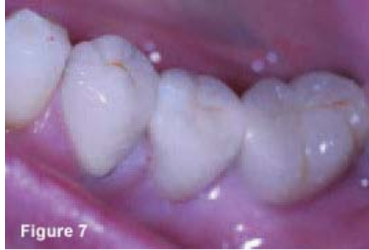
Figure 7 — A final finish is achieved with Embrace Seal-n-Shine, which was light-cured for 20 seconds.