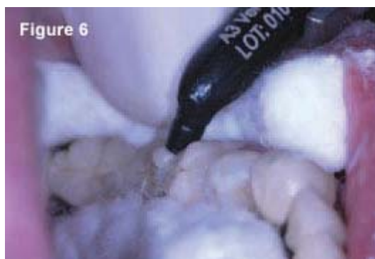
Figure 6 — Venus composite resin (Heraeus Kulzer) was placed over the opaque layer and light-cured for 20 seconds.

Next, Seal-n-Shine was used to seal the margins against micro leakage and provide the final finish and polish to the composite and porcelain surface (Figure 7).