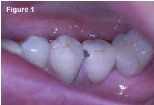
Figure 1 — Shows fracture of the mesialocclusal- buccal portion of the lower left first molar pontic (tooth No. 19) on a 6-unit porcelain-fused-to-metal fixed bridge.

In the following case, the patient fractured the mesial-occlusal-buccal portion of the lower left first molar pontic (No. 19) on a 6-unit PFM fixed bridge (Figure 1). This was unusual because the patient has passive occlusion on this tooth and no other porcelain fractures were noted. The fracture was noticeable when the patient smiled. If allowed to remain, the cracked, exposed porcelain would continue to chip away. It needed to be repaired to maintain the integrity of the bridge and satisfy the patient's esthetic needs. It is important to create as much mechanical retention as possible to have the best chance for a successful repair. 1 Roughing up the metal surface with a fine diamond is imperative, and undercuts are valuable for retention form (Figure 2).